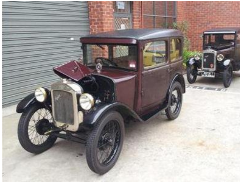
Austin 7 Saloon with Club Registration 1-769, outside the Austin 7 Clubrooms 2015.

It now has a full set of the correct Austin 7 tools in a reproduction of the original Tool Roll together with the correct 7" Jack, Tyre Pump and Wheelbrace.