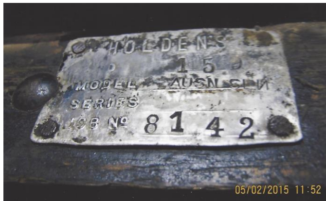
Original HOLDEN'S aluminium body plate under the back seat, stamped BODY No 159, MODEL AUSN SLN, JOB No 8142.