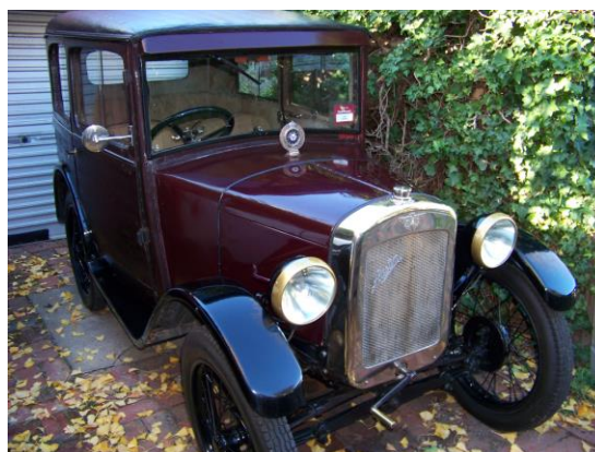
The car has covered 83,000 miles in 87 years, driven by just three owners.

In January 2015 Tony Press bought the Saloon with damaged door from Roy Wilson. It had been sitting well covered in a garage for the previous ten years, still with the original ID plate showing car number A8 6175 and fitted with the non running magneto engine M83747. Following an investigation into The Austin Motor Company surviving factory record books held at The British Motor Museum, Gaydon UK, the car was listed as a 'chassis for export' on 26 April 1929, with Chassis Number 83609. The purchase from Roy included the original coil motor M 83747 which had been carefully stored for the past 40 years in the garage alongside the car. With David Lowe's invaluable assistance over seven weeks the car was lovingly overhauled and the original coil motor re fitted after honing the bores and replacing worn valves. The body was cleaned and fitted with new carpet; the original fabric covering on the damaged door carefully repaired with new window glasses and remade slide guides fitted. Five new tyres and battery were fitted and the poorly made front footbrake connection was removed, returning the car to separate front and rear brakes. The Lucas 7" headlamp reflectors were resilvered and finally the Lucas AT 201 tail lamp was restored after minimal re-wiring. Following a written request to VicRoads Motor Registration branch they approved transfer of the original Club 'red plate' registration 1-769 to the new owner.