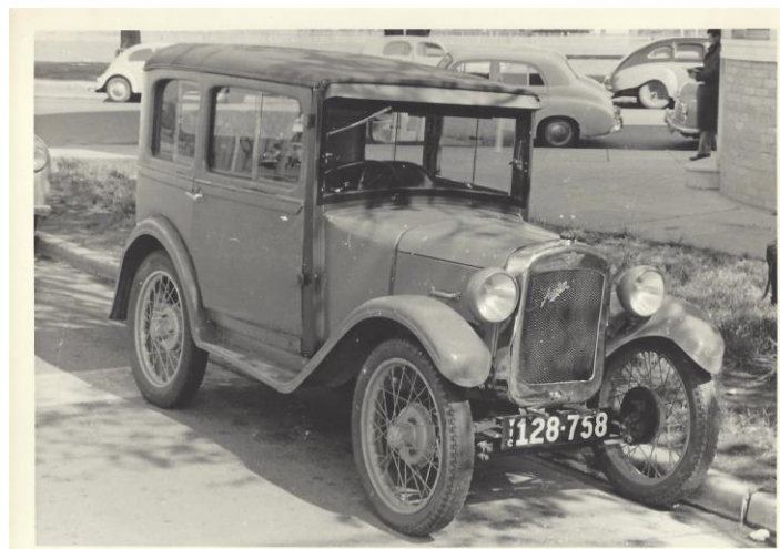
My first 1929 Fabric Saloon outside Caulfield Tech in 1959

It is interesting to note that my first complete car in 1957 was a 1930 Austin 7 Holden bodied fabric saloon, manufactured a few months after the above car.