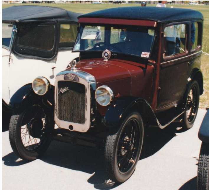
1929 Saloon photographed on a rally in 1970, owner Roy Wilson.

In 2004 the near side door was damaged in an unfortunate event when the car was being carried to a rally mounted backwards on a trailer. The door flew open, came off the hinges and crashed to the road breaking the window glasses and damaging the fabric and wooden frame. Roy managed to recover the remnants and spent a number of years attempting to get it repaired. The damaged woodwork was carefully restored but repairing the fabric covering and replacing the glass was proving difficult.